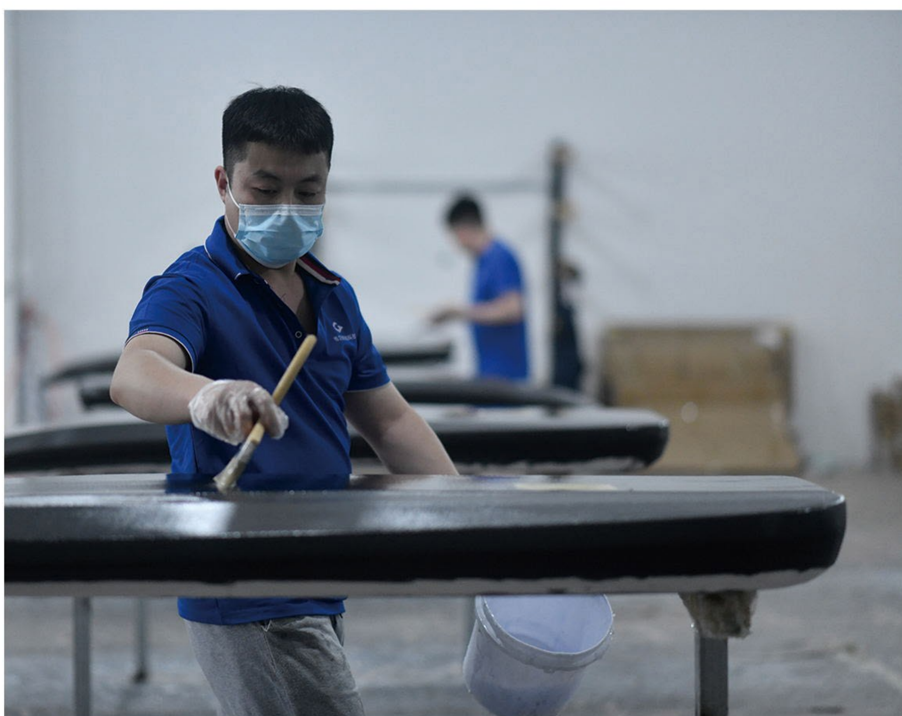
积层 / lamination