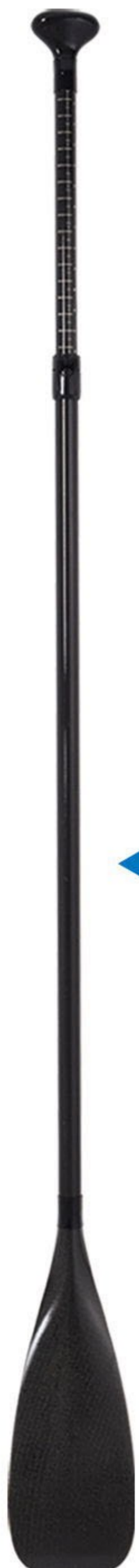
Carbon fiber paddle