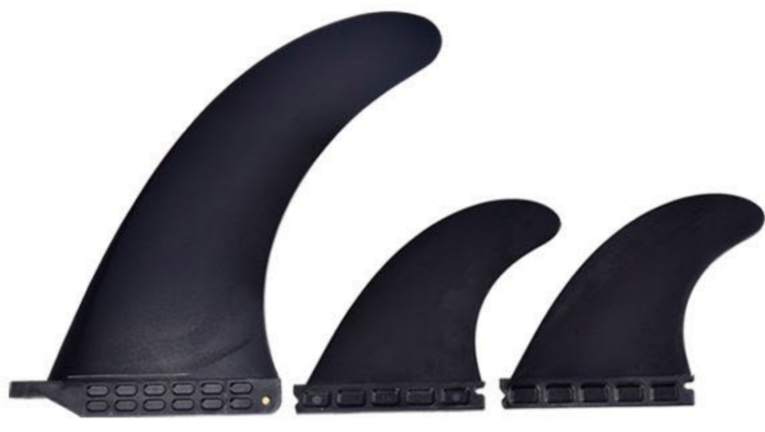
Carbon fiber fins