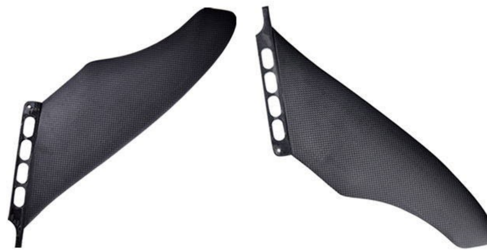
Carbon fiber fins