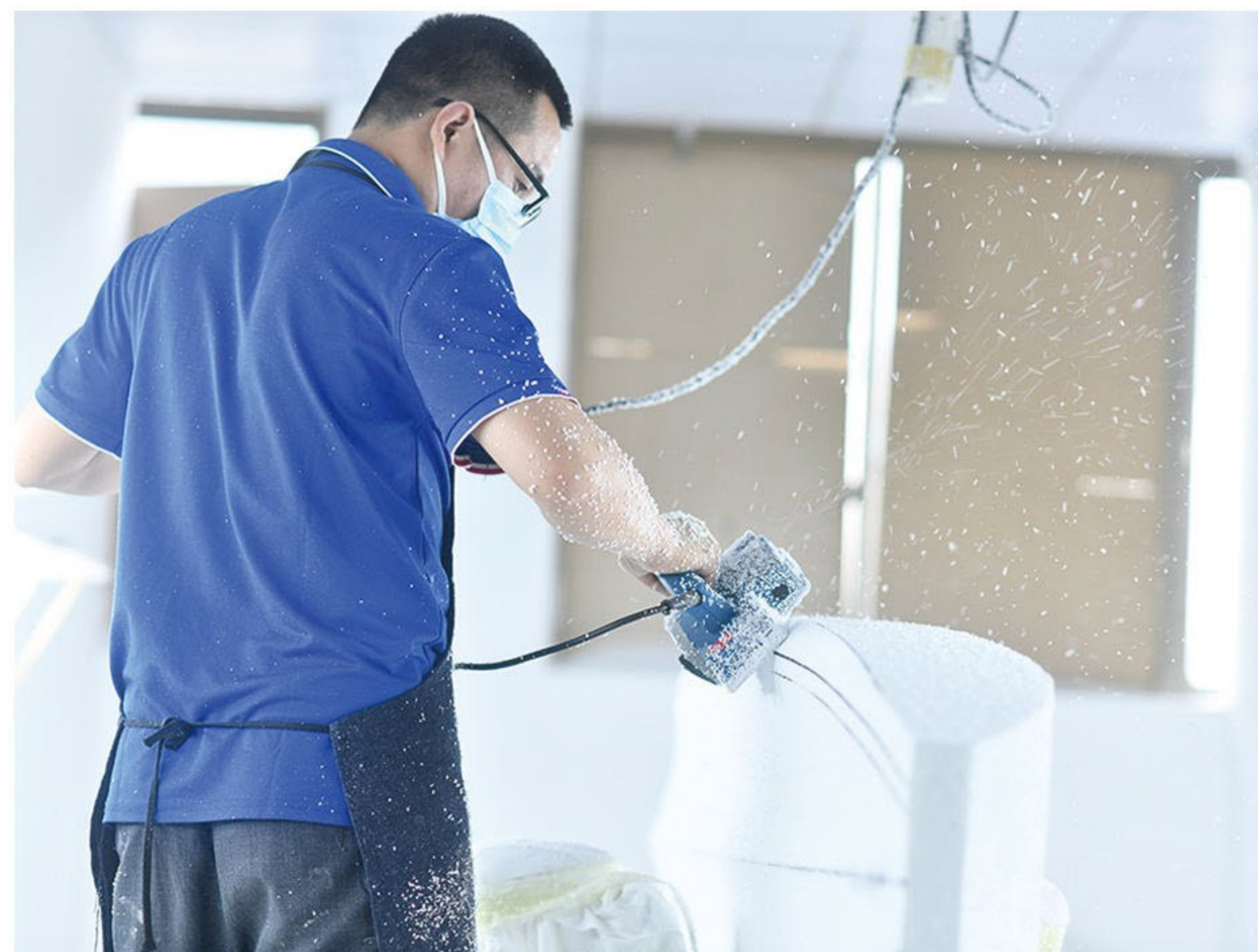
成型打砂 / Molding sand