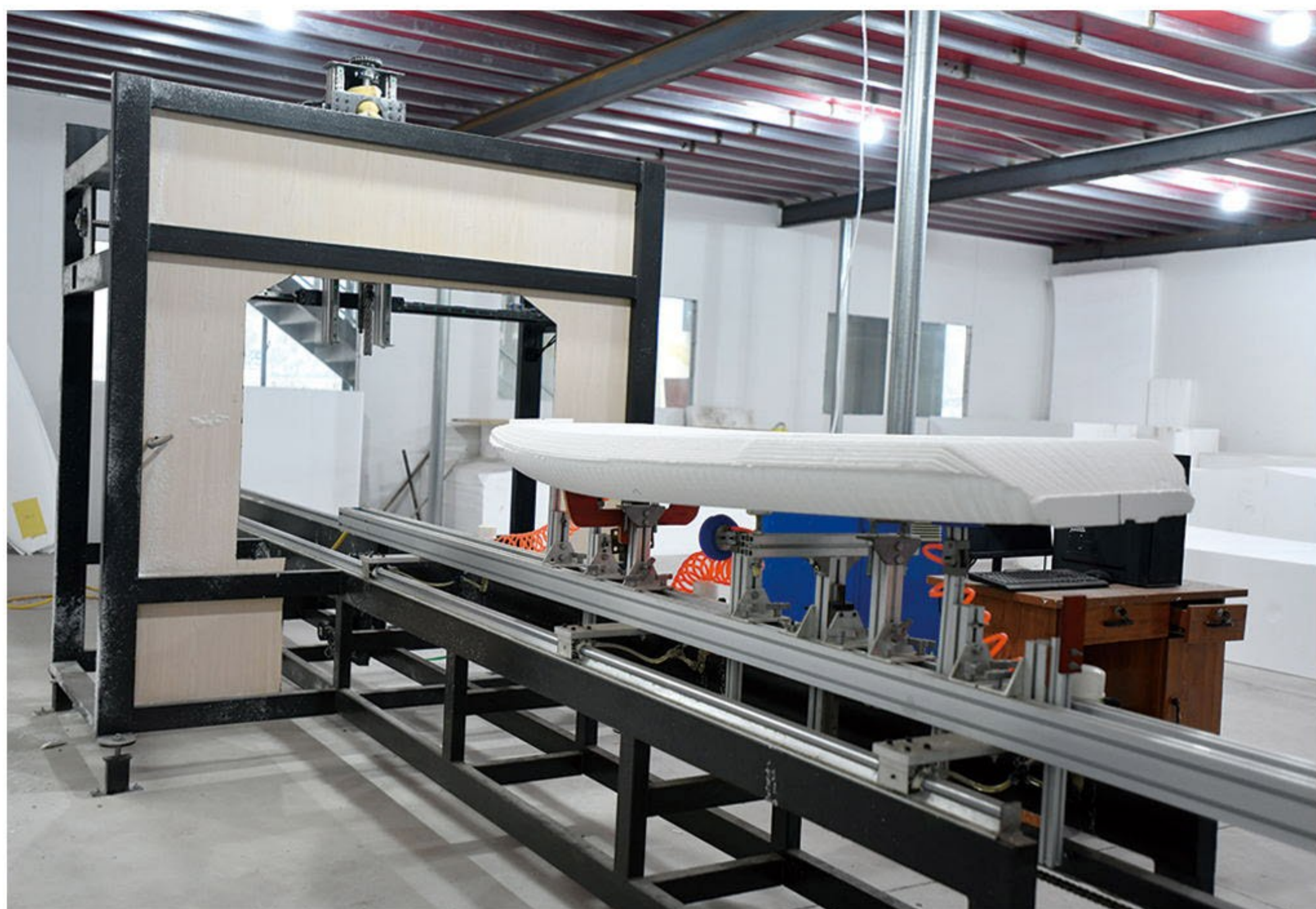
雕刻机 / Engraving machine