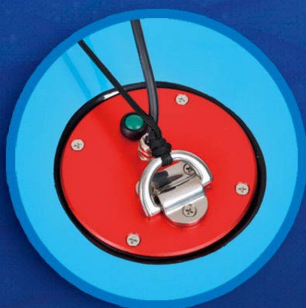
Gear change switch assembly