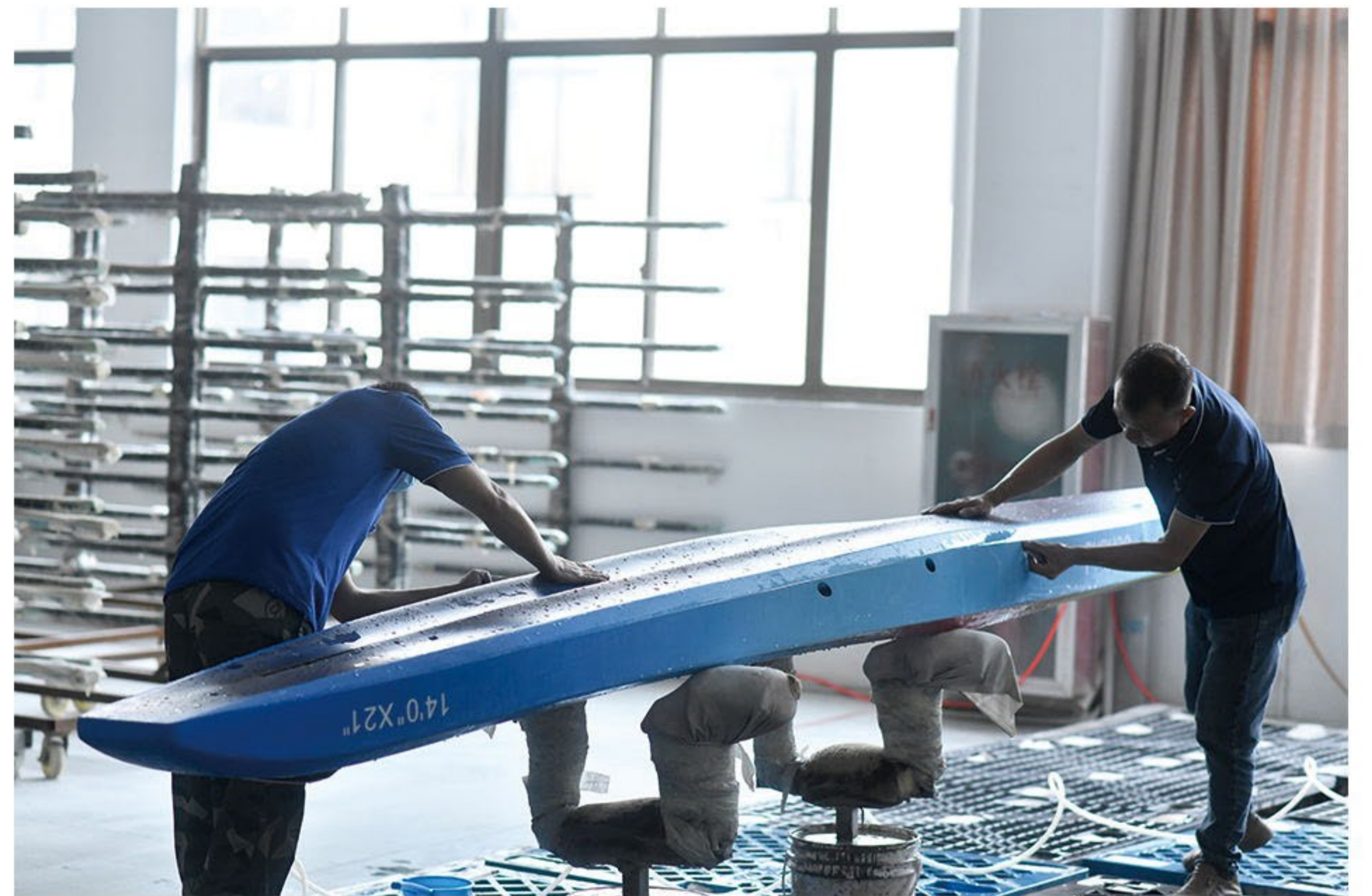
抛光 / Polishing