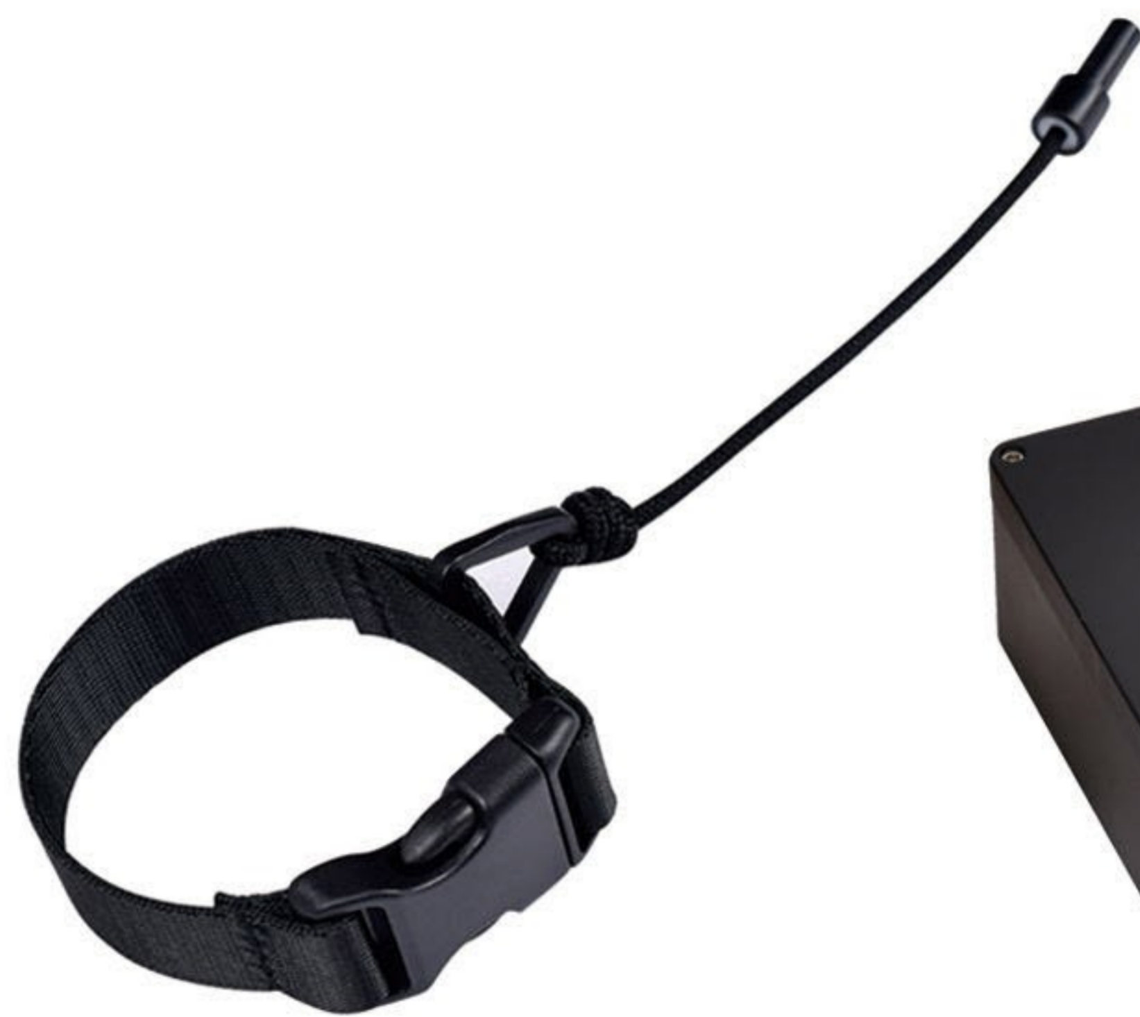
Security key Bracelet