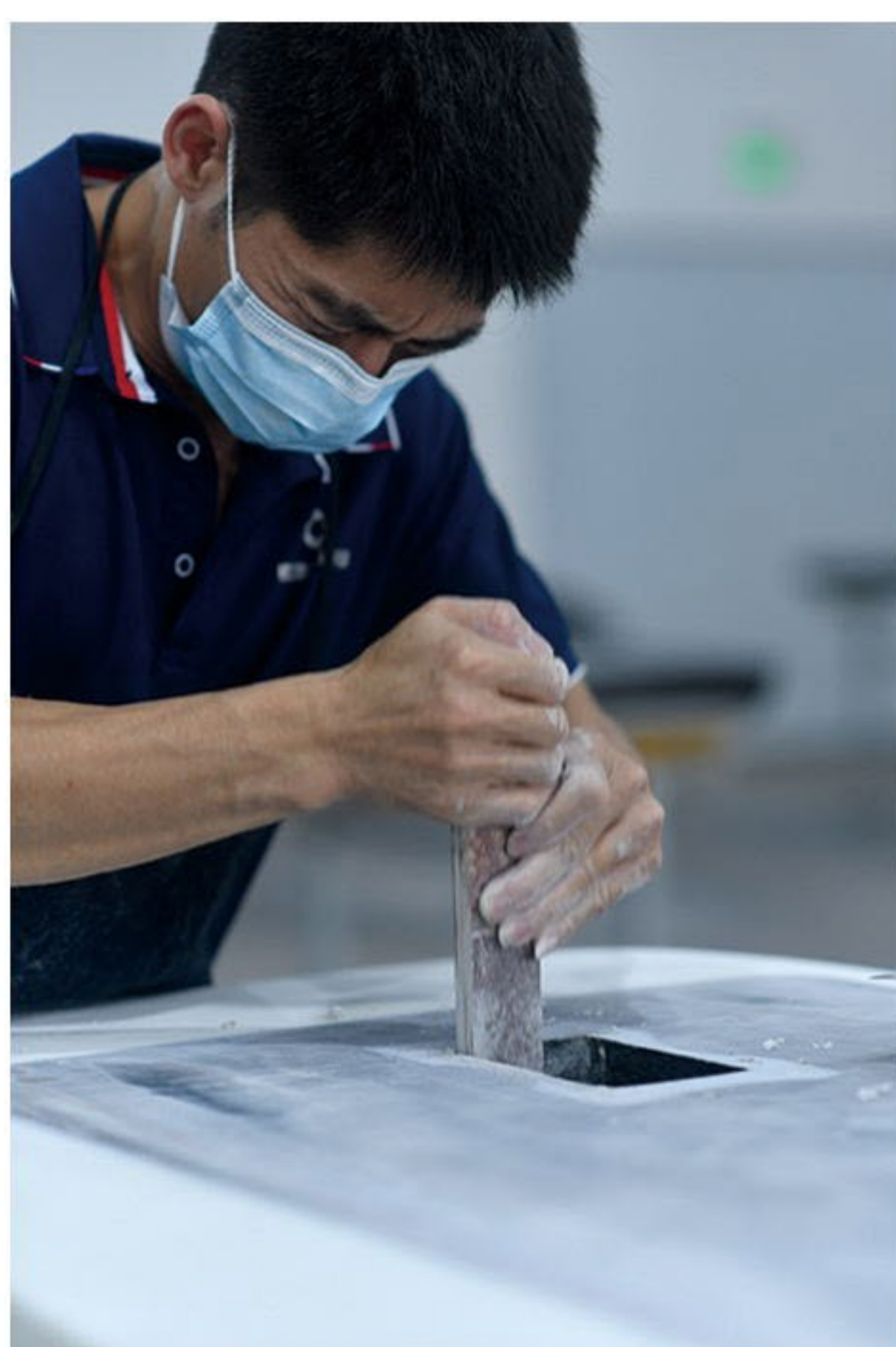
配件 / Attachment