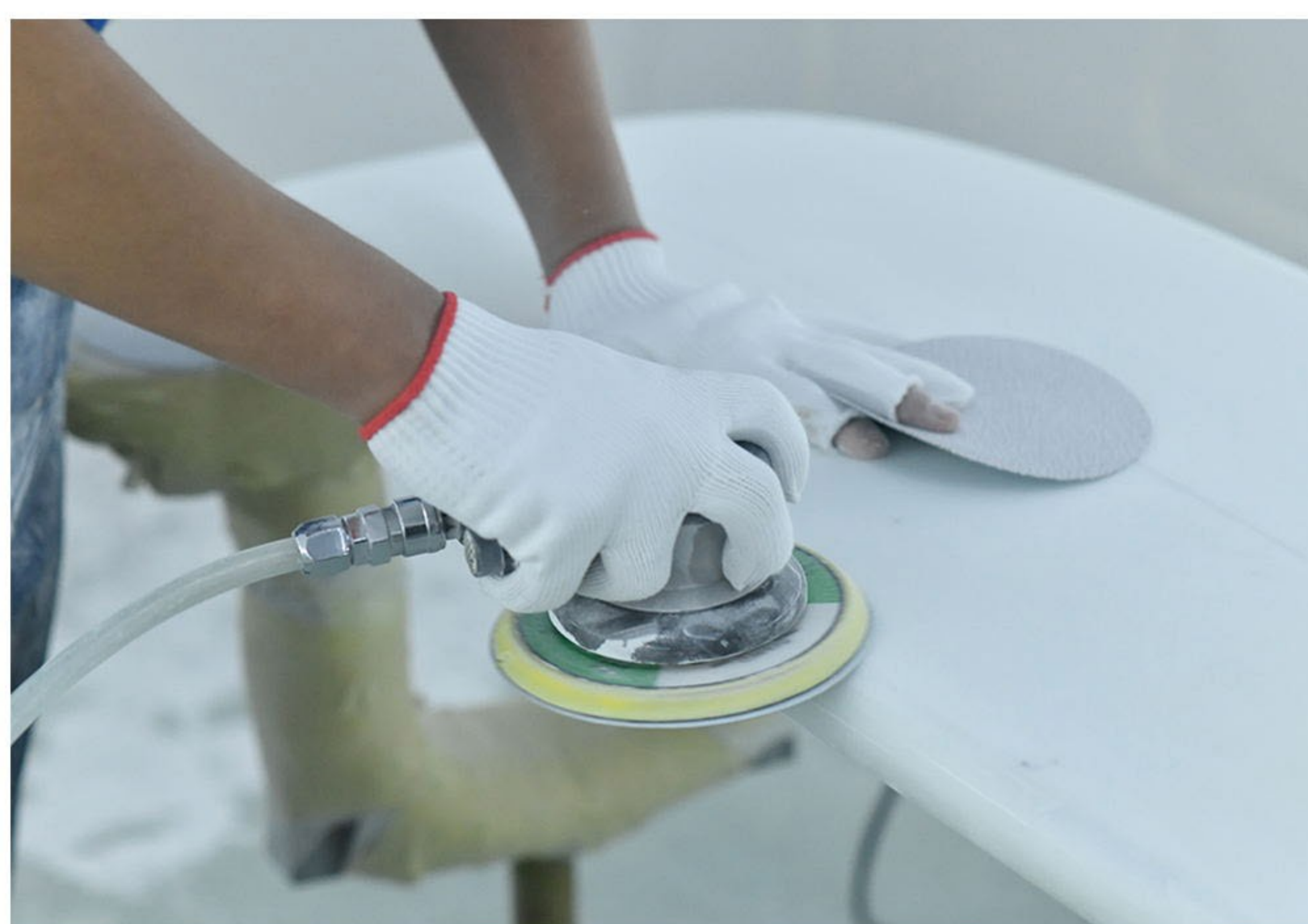
打磨 / Polish